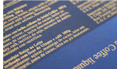
Example of a high-resolution gold print with nyloflex® Gold A 116 D

or on rough substrates, the nyloflex® Seal F and nyloflex® Gold A plates meet virtually all coating requirements and cover all printing press formats up to size VI.