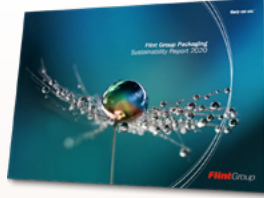
Sustainability Report 2020